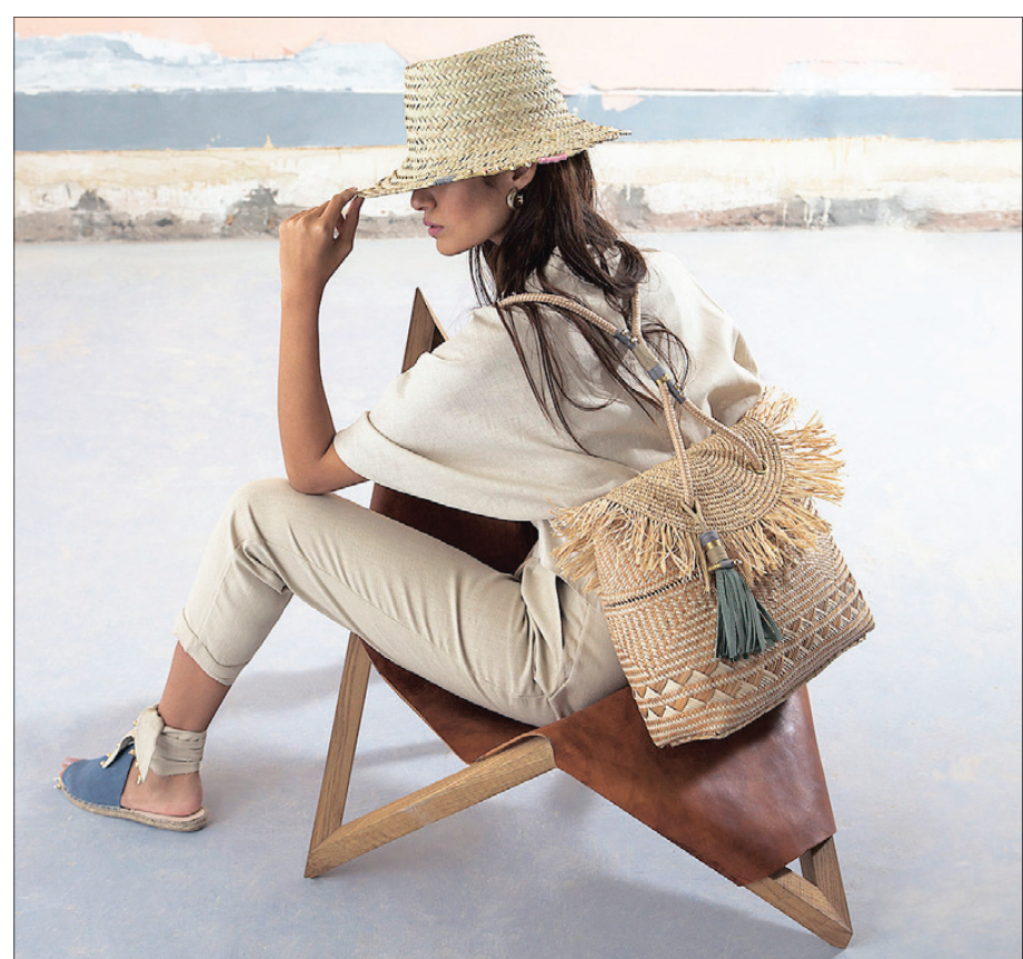
EARTHY: Natural hues take the lead in a blend reminiscent of desert landscapes, with lots of deep colours.