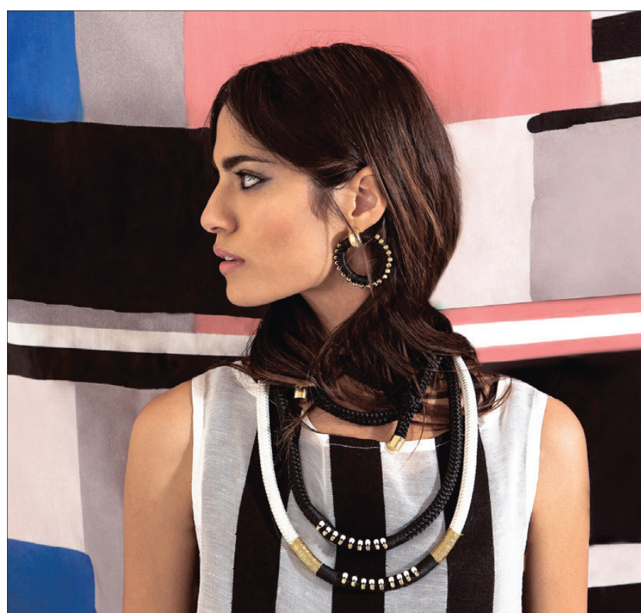
STATEMENT PIECES: Influences of Indian ceremonial jewels come through in the PICHULIK jewellery.